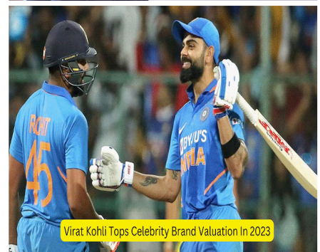
Virat Kohli Tops Celebrity Brand Valuation In 2023

(D) Cricketer Virat Kohli has taken the top spot to become India's most valuable celebrity. Their brand value in 2023 will be $227.9 million. Cricketer Virat Kohli has topped the list to become India's most valuable celebrity in 2023, boasting a brand value of $227.9 million.